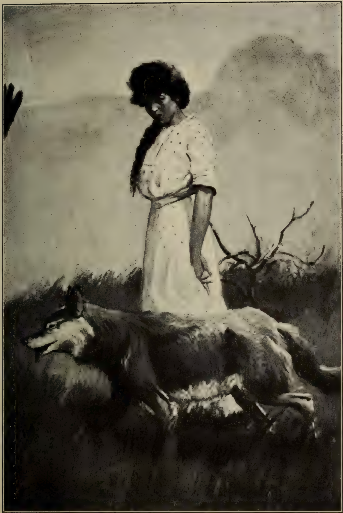
Nepeese, the trapper's daughter, known to the forest men as "The Willow," who became a big factor in the life of the pup Barea.